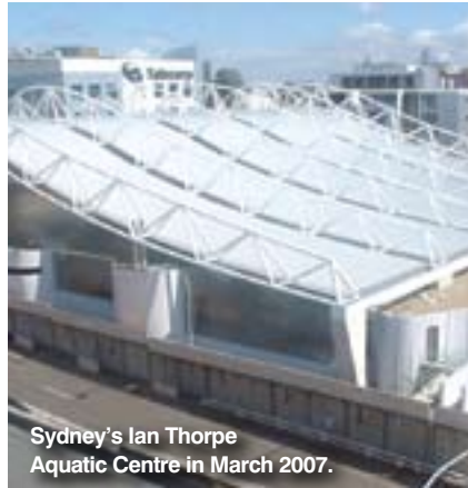
Sydney's Ian Thorpe Aquatic Centre in March 2007.