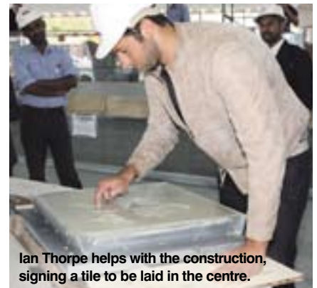
Ian Thorpe helps with the construction, signing a tile to be laid in the centre.

The Ian Thorpe Aquatic Centre is still a construction site and access will be restricted to those wearing sturdy closed shoes. Wheelchair access to one level of the building will be available on the day. If you have questions regarding the level of access, please contact the City on 9265 9333.