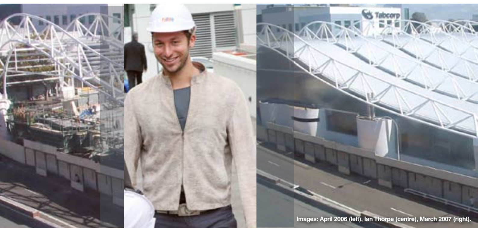
Images: April 2006 (left), Ian Thorpe (centre), March 2007 (right).